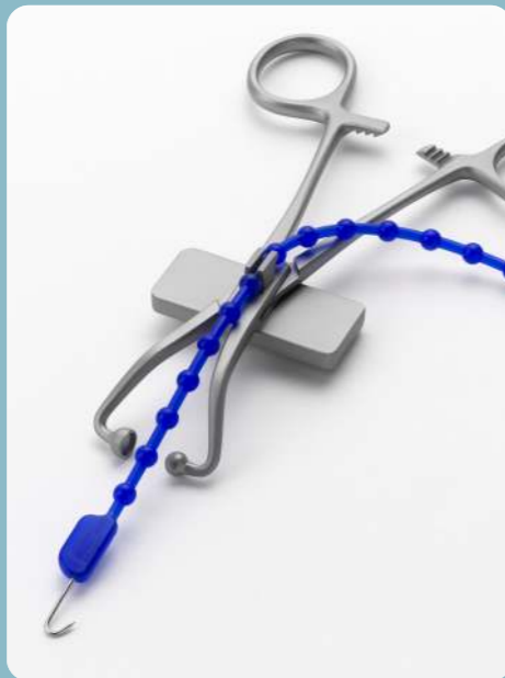
Unique weighted forcep for retention