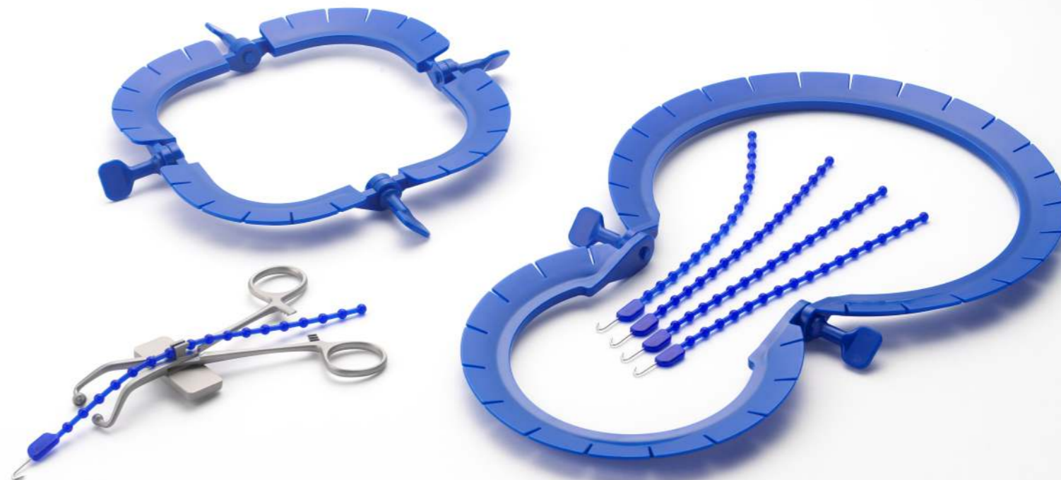
Elasticated retraction system for ease of access to the surgical field

Forceps are provided free of charge - please contact for more information