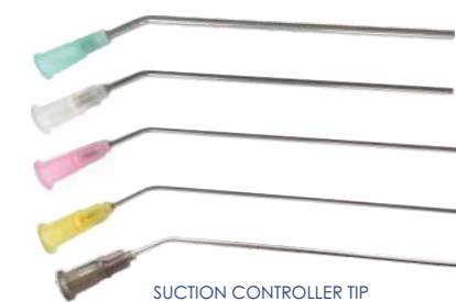
SUCTION CONTROLLER TIP